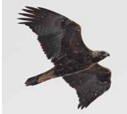
The 2025 season experienced an exceptional Golden Eagle flight on October 8-10 and again on October 17-18.

487 sharpies (120/100 hrs.). Cooper's Hawks were third in abundance, with 389 individuals (95/100 hrs.). A complete list of the total count for each of the 22 migrating raptor species tallied for 2025 is shown in below.