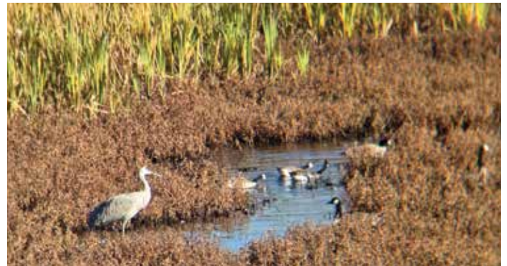
Sandhill Crane and Canada Geese enjoying an autumn day in the Indreland Audubon Wetland Preserve.