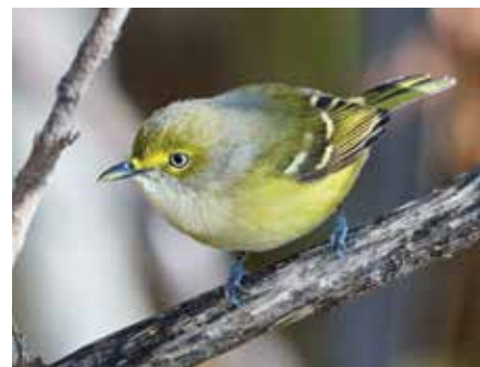
A White-eyed Vireo, spotted in northwest Bozeman, is a rare vagrant to be spotted in this area.