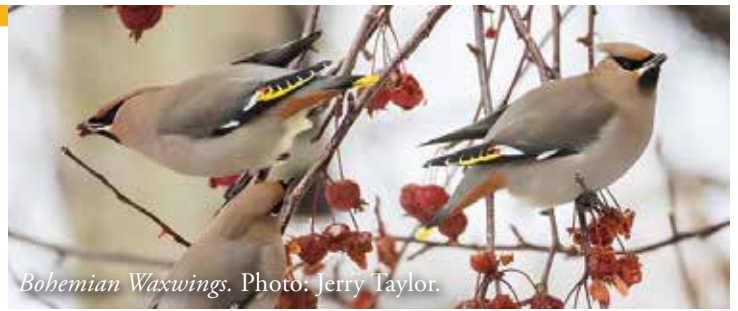
Bohemian Waxwings.

* Teams may observe by car, foot, snowmobile, or ski on the day of the event. There will be an optional meeting at the Grizzly & Wolf Center at 7:30 AM for participants to gather before heading out to their routes or counting locations.