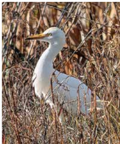
Cattle Egret "Carl" made a lengthy stay in the field just west of Bozeman's Baxter Lane Post Office.