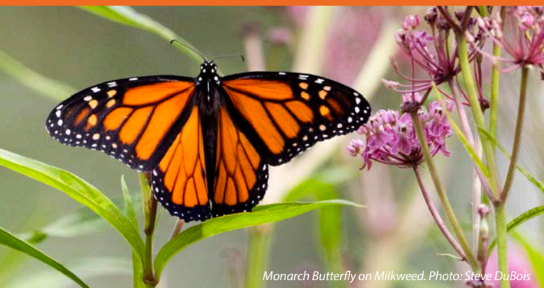
Monarch Butterfly on Milkweed.