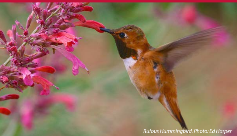
Rufous Hummingbird.