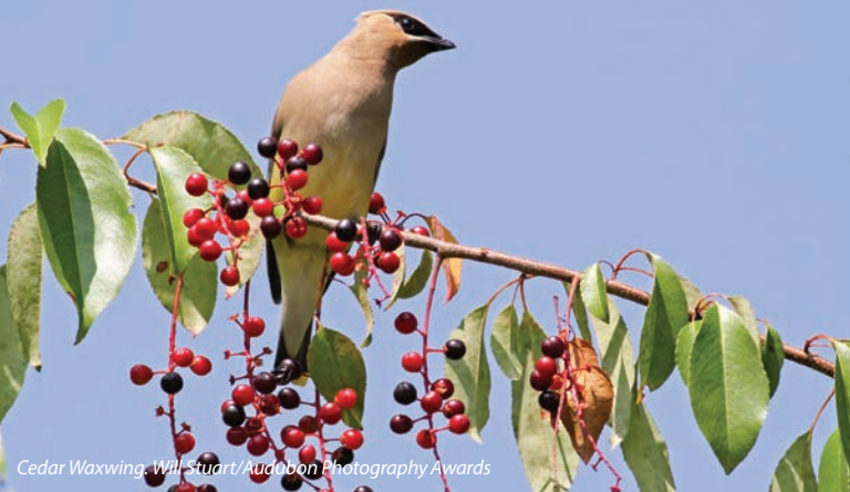
Cedar Waxwing