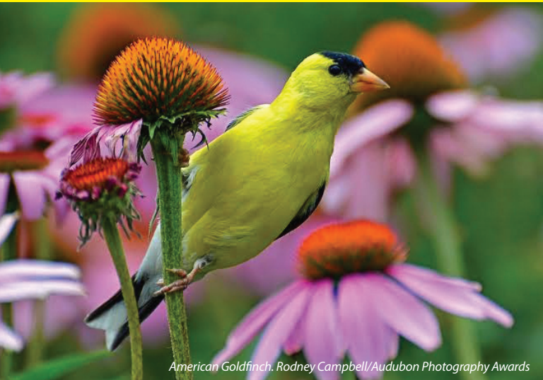
American Goldfinch.