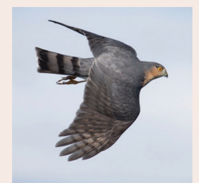
Sharp-shinned Hawk at Bridger.

Purchase raffle tickets at SAS program meetings and IAWP Trivia Nights, or request tickets online at: <a href="https://secure.lglforms.com/form_engine/s/Q0pL3HYUgMa_wF7Odow5hg">https://secure.lglforms.com/form_engine/s/Q0pL3HYUgMa_wF7Odow5hg</a>