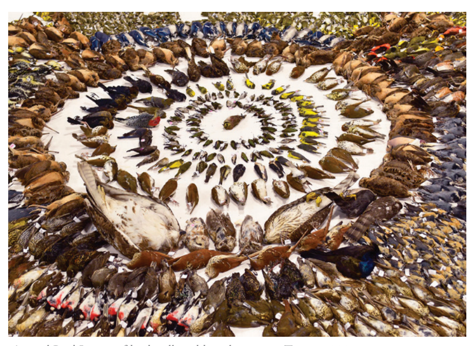
Annual Bird Layout of birds collected by volunteers in Toronto, 2021.

A related issue is the disorienting effect of artificial light on night-migrating birds. Concentrations of bright light affects a