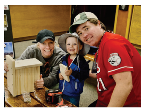
An enthusiastic family builds a nest box for chickadees.

us with an opportunity to promote an appreciation of raptors and educate the public on the importance of a variety of conservation measures, such as the importance of using lead-free ammunition when hunting to protect the health of eagles and hawks, and treating our home's windows in various ways to make them visible to birds in order to prevent deadly window strikes.