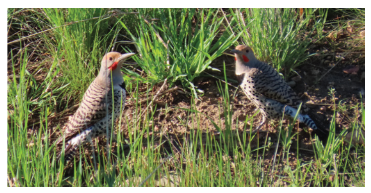
Northern Flickers.