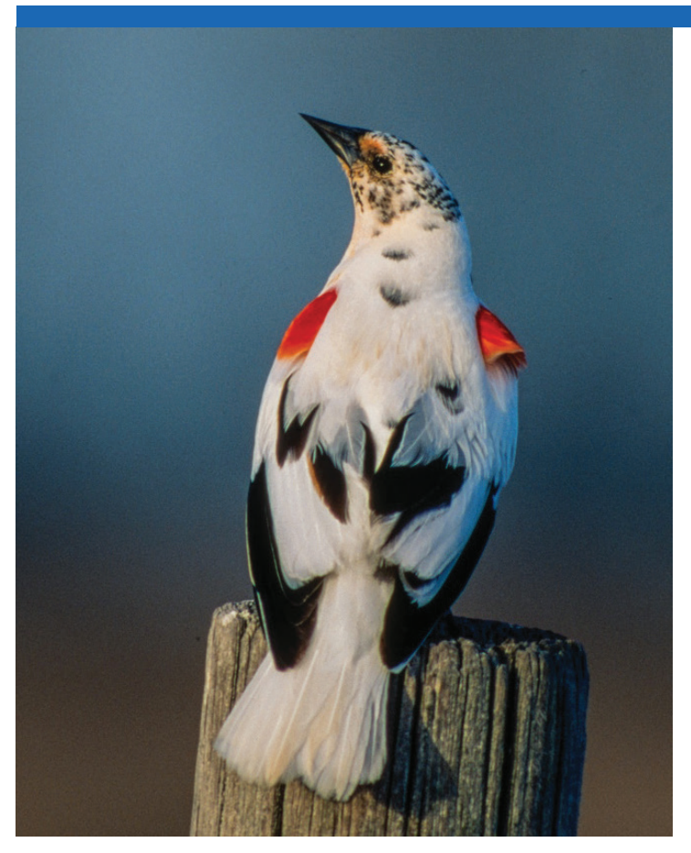
A male leucistic Red-winged Blackbird.

Find more at the Sacajawea Audubon Society website at sacajaweaaudubon.org