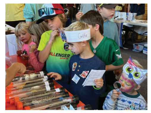
Study skins of birds fascinate kids.

in support of raptor conservation. Sacajawea Audubon Society has a big role and takes the lead in providing numerous educational activities for families including Sketcha-Bird, Binocular Blitz, Build a Nifty Nest Box, and playing the Great Migration Challenge Game. This year we also provided face painting much to the delight of hundreds of enthusiastic kids. This celebration of raptors is free, open to all and is a fantastic gift to the community. It provides