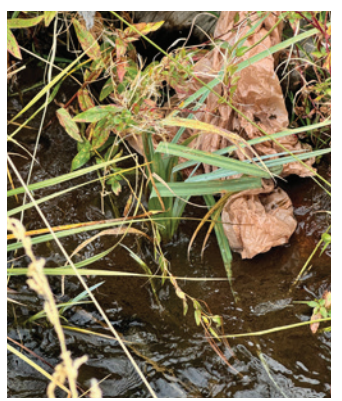
Plastic shopping bags in a stream.

s you head to the ballot box this year, you may be hearing about the Bozeman Plastics Ordinance (BPO), a citizens' ballot initiative that will prohibit the distribution and selling of single-use plastics bags (carryout bags) and polystyrene containers (food containers and packing peanuts) within the city of Bozeman. If the BPO passes, Bozeman will join ranks with cities (and counties) worldwide that have reduced plastic pollution, taken action against microplastics in our waters, and saved money.