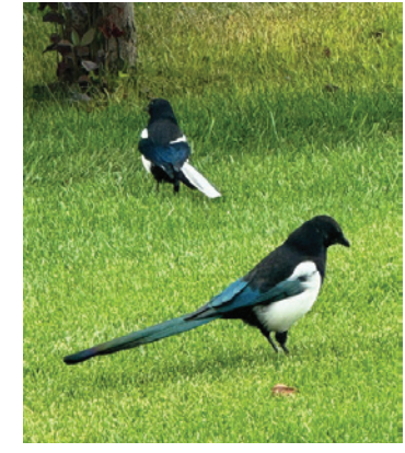
Black-billed Magpie.

intriguing is that Mike saw a magpie with the exact same pattern of leucism at the same location several years previously. Typically, magpies' life expectancy is around five years, but it's not unusual for them to reach ten years in age. Some even live to fifteen years, with the oldest reaching twenty years. Hopefully, birders in this neighborhood will be on the lookout for this eye-catching bird.