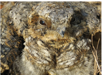
What can 11 years of observation, 230 birds banded, and 120 birds tagged tell you about one Common Poorwill population?

research networks that address conservation at larger scales, largely through the use of the Motus Wildlife Tracking System.