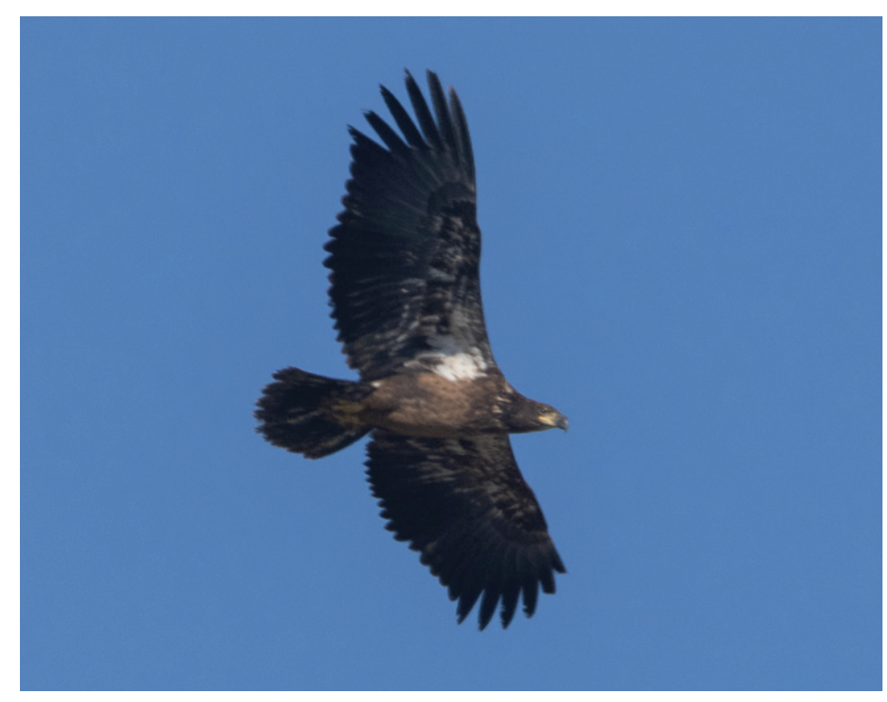
Second year Bald Eagle.

Sacajawea Audubon Society enjoyed another great weekend of public educational efforts at the annual Bridger RaptorFest on October 5th & 6th. In addition to the variety of activities at Bridger Bowl, public visitation at our ridgetop lookout both days was extraordinary, with more than 80 people joining our official counters throughout the weekend. Total daily counts were also good, with 72 raptors of 7 species, including 40 Golden Eagles on Saturday, and 45 raptors