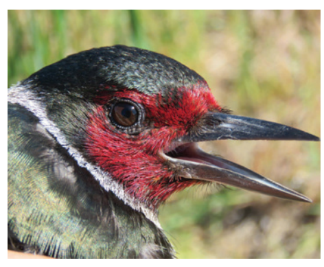
You can't tell a male from a female Lewis's Woodpecker in the hand, but you'll learn how to tell them apart by vocalization in this presentation.

uses bird activity to evaluate the success of restoration treatments. She will also share how longterm observations of basic natural history reveal marvels about species like the Common Poorwill and Lewis's Woodpecker. Finally, she'll discuss MPG's efforts to develop