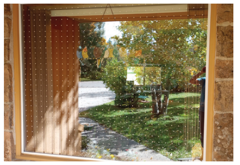
Before and after of a window treated with Feather Friendly Collision Deterrent Marker-Pattern Tape. Taken from the outside looking into the house - note the reflection that so often confuses birds.