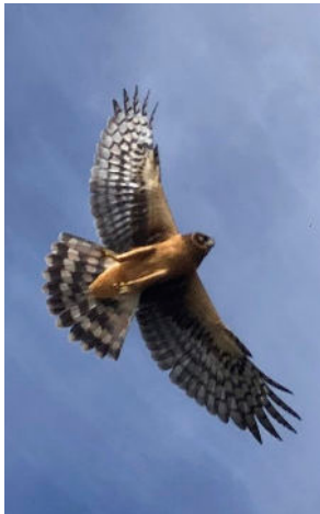
Immature Northern Harrier.

In total, we recorded 2,602 migrating raptors.