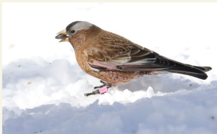
A banded Gray-crowned Rosy Finch. Note that these bands can be any color of the rainbow.

For more information about what is being learned, see Demystifying Rosy-Finches: Understanding the American West’s Off-the-Grid Endemics https://abcbirds.org/rosy-finches/