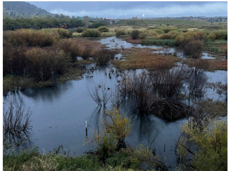
A view of the beaver dam at the Indreland Audubon Wetland Preserve on a rainy evening.

Please consider making a monetary gift to the IAWP. If your finances do not permit giving financially, please consider joining the IAWP Busy Beavers. Every contribution you make of your funds and of your time is impactful for wetland preservation in the Gallatin Valley! Thank You from our Hearts!