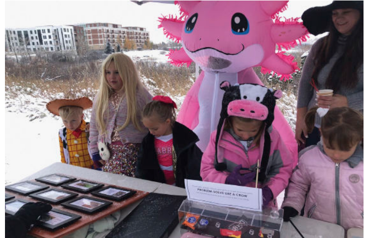
Participants of the Spooky Stroll.