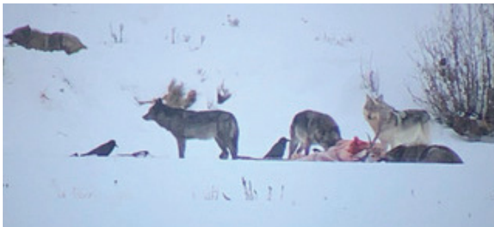
Wolves and Ravens at a kill.

The birds shared their secrets as they flew a hundred miles directly to new kills, commandeered territory, found mates, and reared young. The picture that emerged from their study was that of a highly opportunistic bird with the knowledge that allowed them to exploit wolves but not depend on them. Observations revealed a tenuous and evolving relationship between humans, wolves, and ravens, and the challenges animals face when they wander beyond the protection a national park provides.