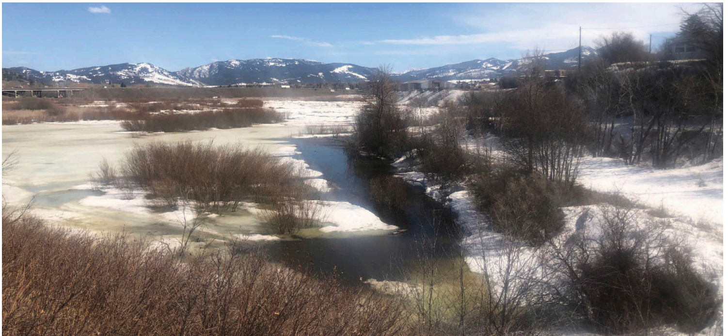
Early signs of winter at the Indreland Audubon Wetland Preserve.

It is important to note that during our initial review of the conceptual plan with a former MRL engineer in 2019, the feedback provided was enthusiastically positive with no concerns raised. In fact, the feedback provided at that time