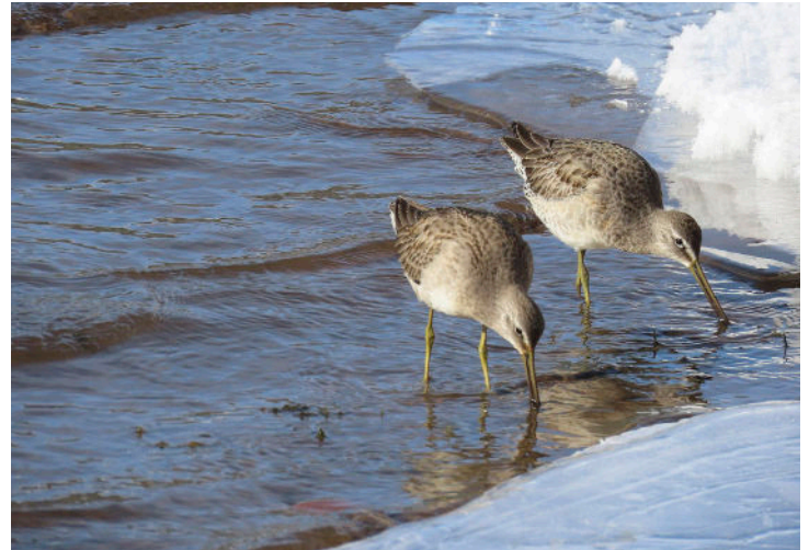
Long-billed Dowitchers.