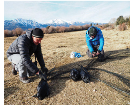
Netting Ravens.

This special in-person SAS program will be held at the Ellen Theatre on December 11th. Doors open at 6 PM; the program will begin at 7 PM. This program is free and open to the public. A $5 suggested donation is appreciated. For virtual attendance, please register at https://attendee.gotowebinar.com/register/6396590749207113560 . After registering, you will receive a confirmation email containing information about joining the webinar.