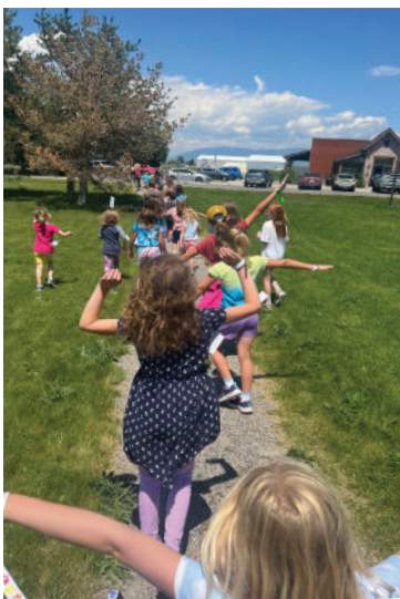
Summer campers at Heart of the Valley “fly” back after playing the Great Migration Challenge Game with the Keep Cats Safe committee.

Last summer, the Keep Cats Safe Committee visited the Heart of the Valley Animal Shelter to teach the Pet Pals Summer Campers about how outdoor cats affect wild birds. We gathered in a grassy lawn in the blazing sun to play a modified version of The Great Migration Challenge Game with 20 very enthusiastic children. Each child chose a bird identity and then “migrated” through a series of stations that taught of the helpers and hazards along the way. To emphasize the effects that outdoor cats have on wild birds, we added several extra stations where kids might end up in the game that said “A pet cat catches you and eats you. Sorry! You died.” The majority of kids that played the game reported that their