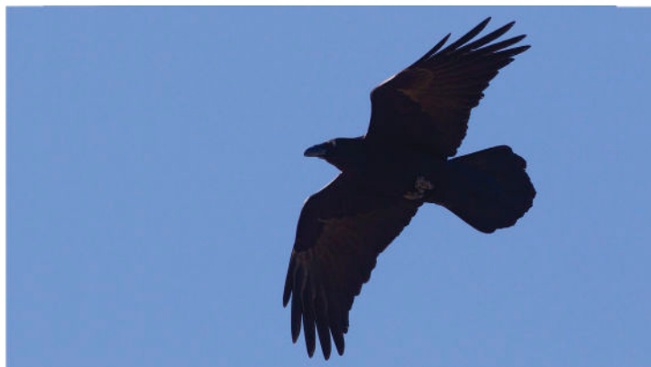
Common Raven.