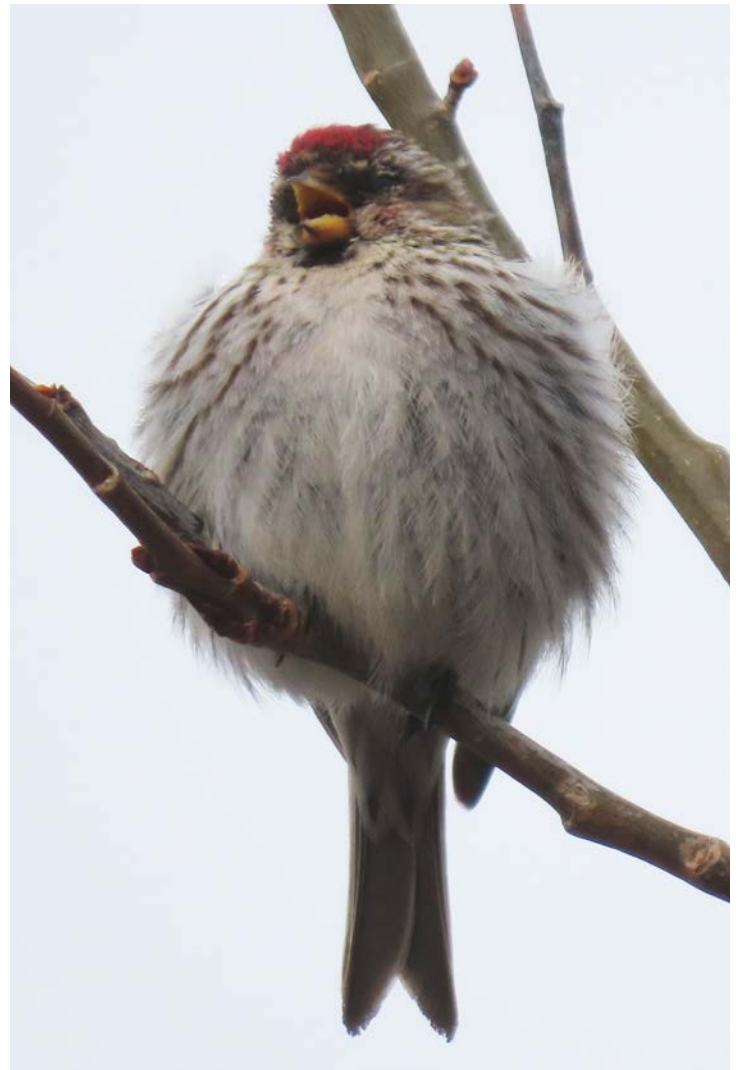
Common Redpoll