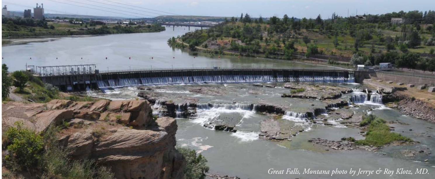
Great Falls, Montana