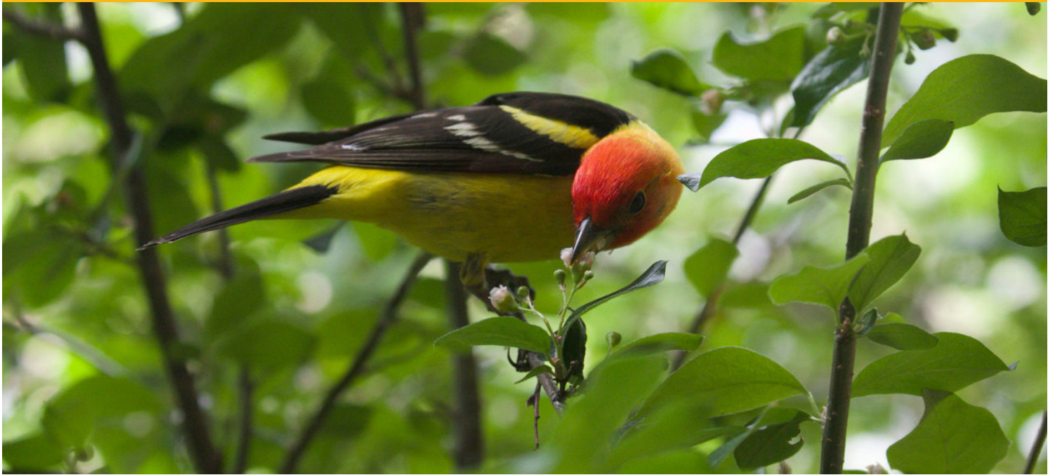
Wester Tanager eating a cotoneaster blossom.