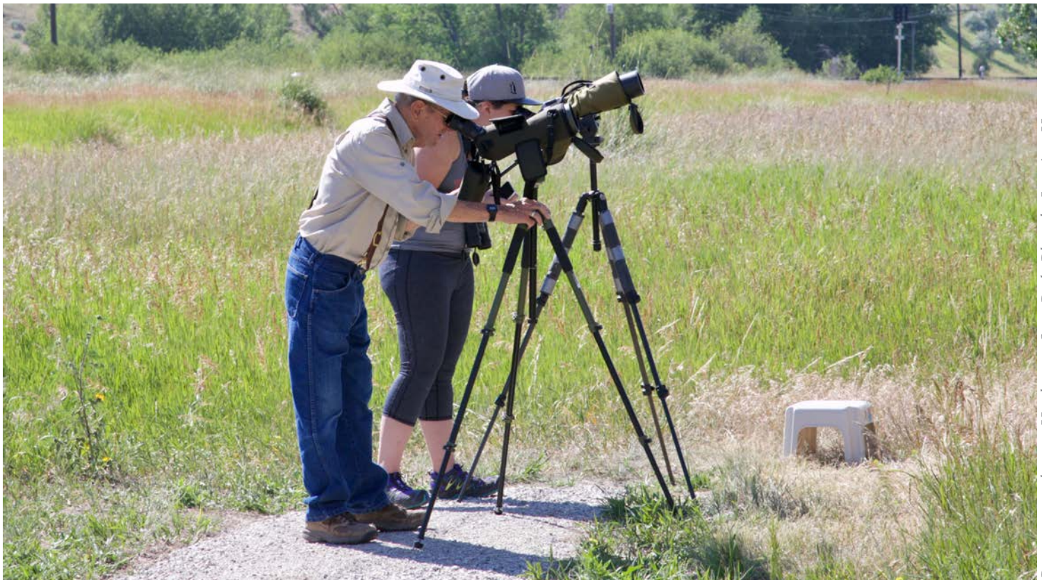
Peregrine watching at Headwaters State Park.