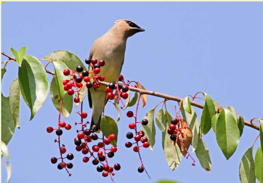
Cedar Waxwing photo by Will Stuart.

Join Sacajawea Audubon Society and the City of Bozeman for a free workshop on Landscaping for Birds on July 15, 9–10:30 AM , at the Story Mill Community Center (600 Bridger Canyon Drive). Learn about the best plants and landscaping practices for making your yard a welcoming haven for songbirds, pollinators, and other wildlife. Attend a half-hour presentation in the Story Mill Community Center and then take a short walk to the Plants for Birds Demonstration Garden in Story Mill Park. You will learn landscaping tips and see first-hand the top plants that attract birds and provide them with what they need to thrive in our communities.