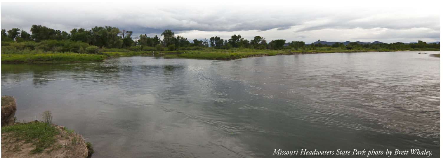
Missouri Headwaters State Park photo by Brett Whaley.

This is an opportunity to stretch your legs and look for some early arriving migrants in the Bridger foothills north of Bozeman. Middle Cottonwood has a mix of riparian habitat, mature north-facing conifers, and relatively dry open south-facing hillsides. We'll be looking for species such as Western Tanager, MacGillivray's Warbler, Calliope Hummingbird, Lazuli Bunting, Green-tailed Towhee, and Swainson's Thrush along the lower reaches of the canyon. 8-person limit.