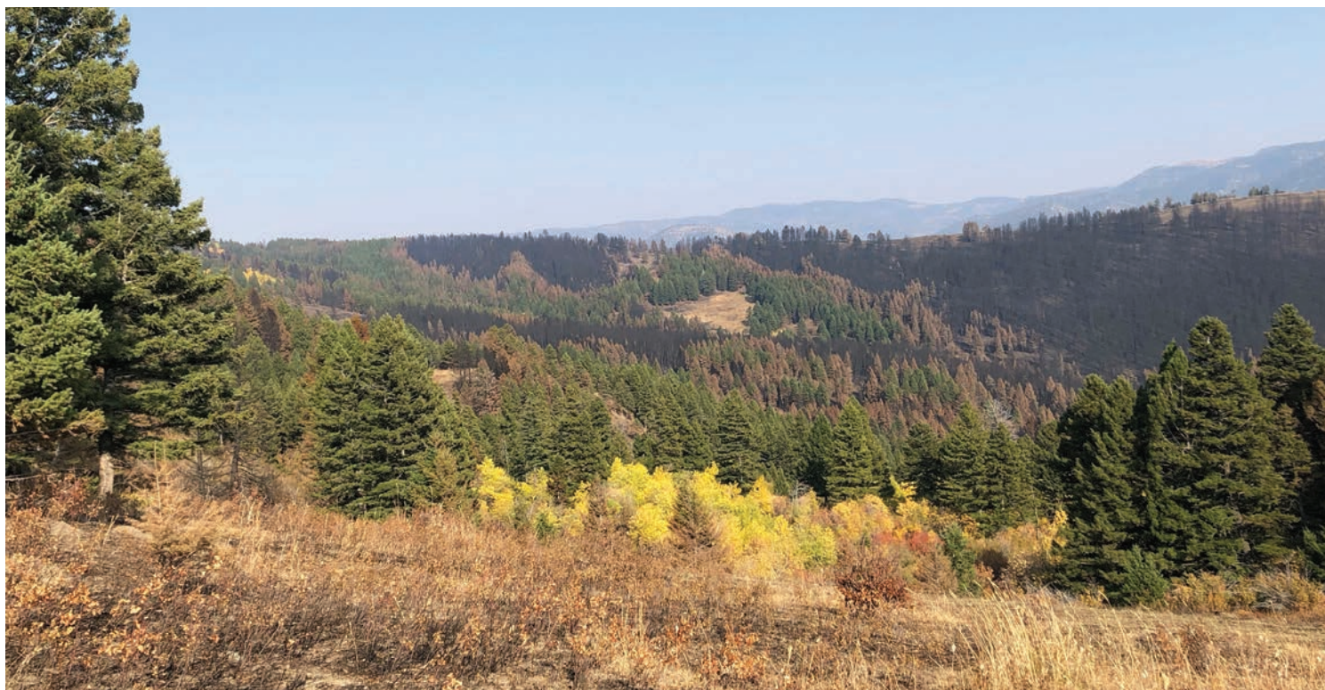
The June 18 field trip will explore the burn within the 2020 Bridger Foothills Fire perimeter.

Once we arrive in Mammoth, we will be hiking the 5-mile Beaver Ponds Trail. The diversity of habitats along the Beaver Ponds Trail is unmatched by any other trail of such short length in Yellowstone. The Beaver Ponds Trail features a wide variety of birdlife including grouse, woodpeckers, and many sparrows as it passes through open forests, sagelands, and skirts several small ponds. If time allows, we will cover other locations on the northern range that are close to Mammoth. Meet at the Museum of the Rockies at 6:30 AM. 8-person limit.