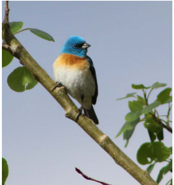
Lazuli Bunting photo by Terri Narotzky.

As this trail climbs the hillside it passes through a number of habitats and transitional edges between them. At the bottom of the mountain, grassland quickly gives way to brushy deciduous habitat as the trail crosses Limestone Creek, where Ruffed Grouse, Calliope Hummingbirds, and Lazuli Buntings are some of the birds to expect. The trail then ascends through