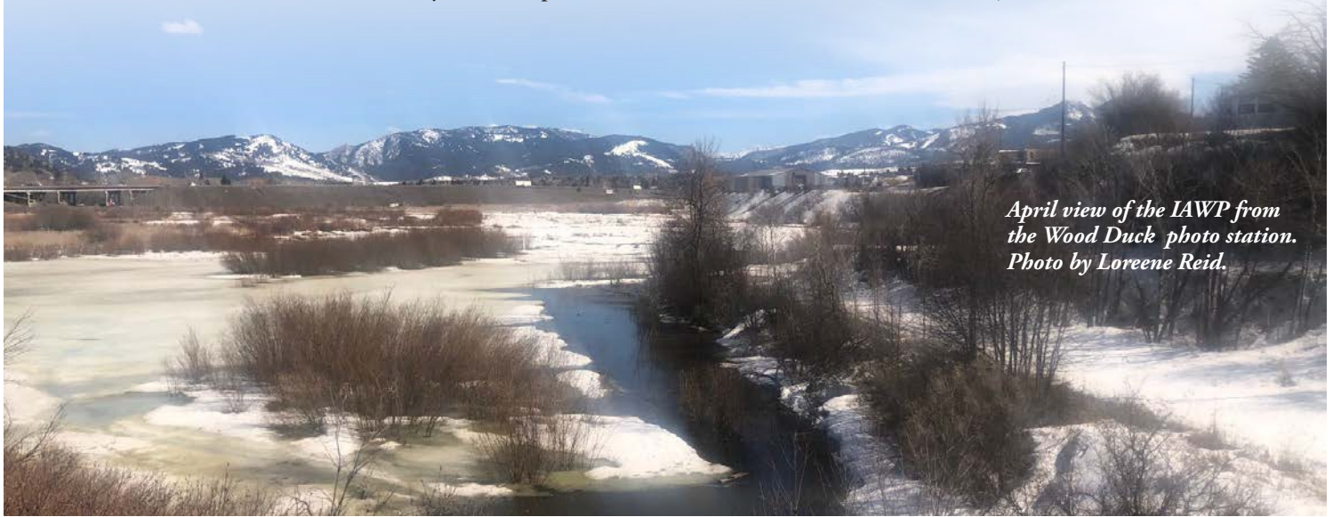
April view of the IAWP from the Wood Duck photo station.

Finally, please consider volunteering for the IAWP by becoming an IAWP Busy Beaver . Visit https://bozemanwetlands.org/WP/become-a-busy-beaver for more information and to sign up for the IAWP Busy Beavers 2023 Volunteer Team. Thank you!