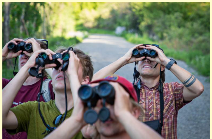
Outside Bozeman’s 2022 Birdathon team.

Does your business want to take a business “Bird Break”? Trade in your briefcase for binoculars, grab your co-