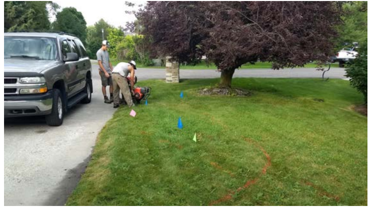
Right: Riverside yard before and after planting a native plant garden.