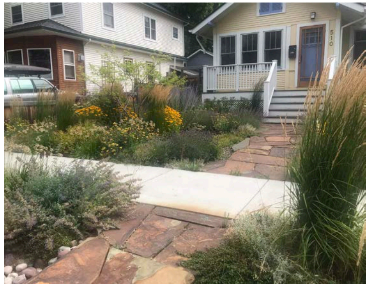
An inviting front yard of drought-tolerant perennials and grasses.

Learn about the fascinating lives of native bees and honey bees as we visit the gardens of Casey Delphia and Justin Runyon. They have planted their small Bozeman yard with large gardens of native drought-tolerant flowers and turned it into a haven for bees, butterflies, moths, and birds.