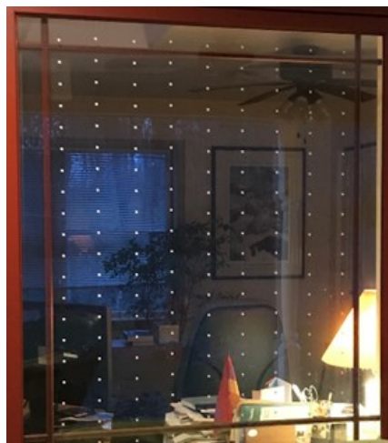
Feather Friendly® Do-it-yourself Tape

Visit the Acopian BirdSavers website for plans or to order them custom made for your windows.