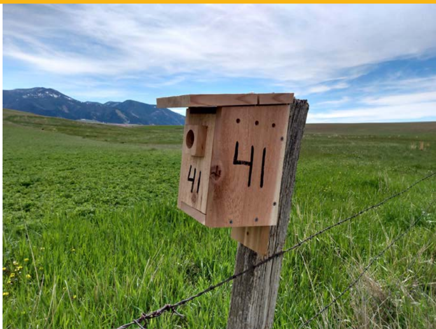
SAS Bluebird Trail nesting box.