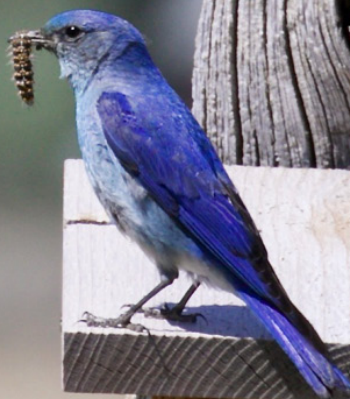
A male Mountain Bluebird poses with his catch.

IS THIS SPONSORSHIP A MEMORIAL? ____ IN WHOSE NAME? _____