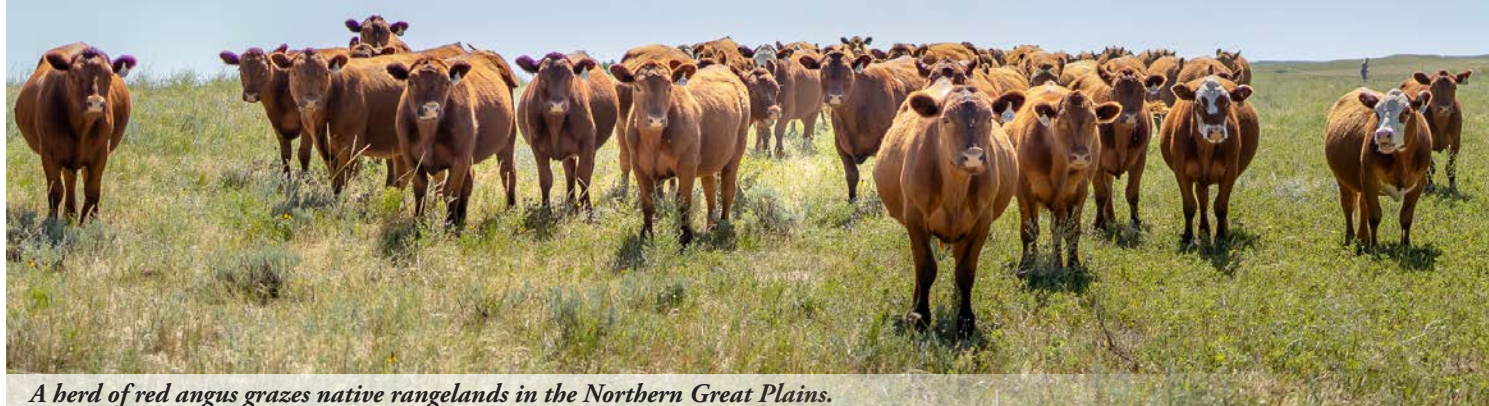
A herd of red angus grazes native rangelands in the Northern Great Plains.

SAS monthly programs are free and open to the public, featuring a special guest speaker the 2nd Monday of each month, September through May. For more information, contact Kyle Moon at programs@sacajaweaudubon.org .