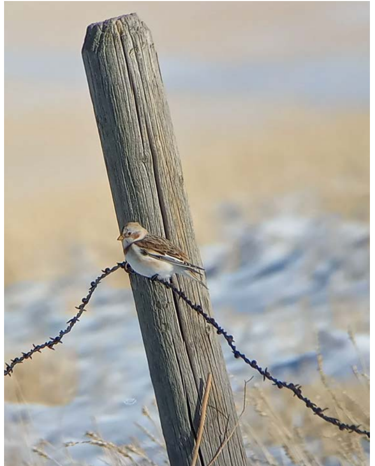
Snow Bunting photo by John Parker.

The Yellowstone and Gardiner counters had an excellent day of counting with 39 species of birds, which is five above the average for the count. Both Bufflehead and Western Meadowlark were seen for only the second time in the 50-year history of the count. The 70 Common Goldeneye set a new abundance record, and two other species equaled their previous high counts. Other uncommon birds seen on the count included Virginia Rail , Harris's Sparrow , and White-crowned Sparrow . Virginia Rails probably turn up on the Yellowstone count more frequently than on any other local count. The hot runoff streams