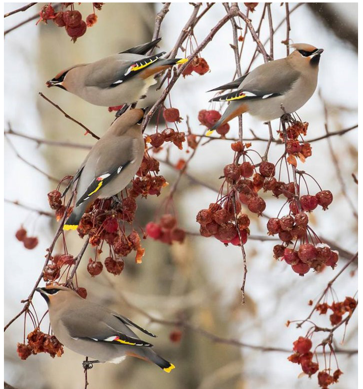
Bohemian Waxwing

Townsend's Solitaire & Juniper: Fri., Feb. 3rd, 2–4 PM at the "M."