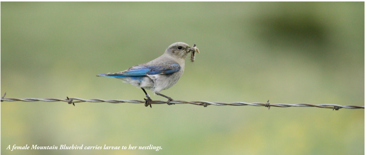
A female Mountain Bluebird carries larvae to her nestlings.

The SAS bluebird trails have hosted primarily Mountain Bluebirds and Tree Swallows. But a number of other species have used the nest boxes, including House Wrens, Mountain Chickadees, and Violet-green Swallows. The occurrence of a nesting Western Bluebird was a trail first in 2014. A female Western Bluebird supposedly mated with a male Mountain Bluebird and laid a clutch of five eggs. She was caught and banded, and recaptured a second time, still incubating eggs. The eggs were found abandoned a couple of weeks later, evidently infertile. There has been a continuing problem with House Sparrows using some nest boxes. In some cases, they have killed bluebird or swallow adults and taken over the box to build their nest and lay eggs. Whenever a House Sparrow nest is found, it is removed along with the eggs and/or nestlings. Predation of the boxes is a continuing problem. Raccoons, snakes, weasels, and kestrels are the most common predators of bluebird nests. An attempt to reduce predation