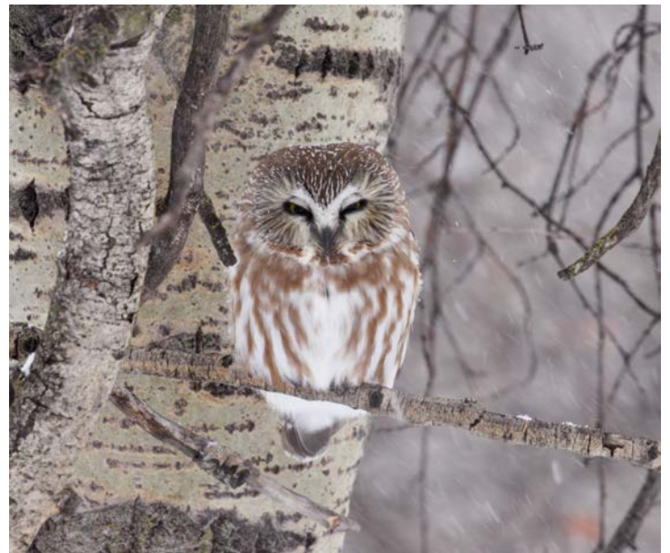
Northern Saw-whet Owl at Story Mill.

If you have participated in the count before and want to record numbers of birds, try the eBird Mobile app or enter your bird list on the eBird website (desktop/laptop) at https://www.birdcount.org/ebird-on-computer/