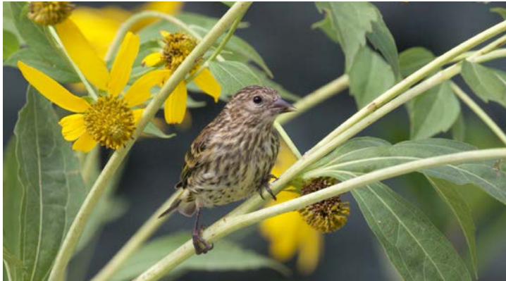
Pine Siskin feeding on Rudbeckia laciniata .