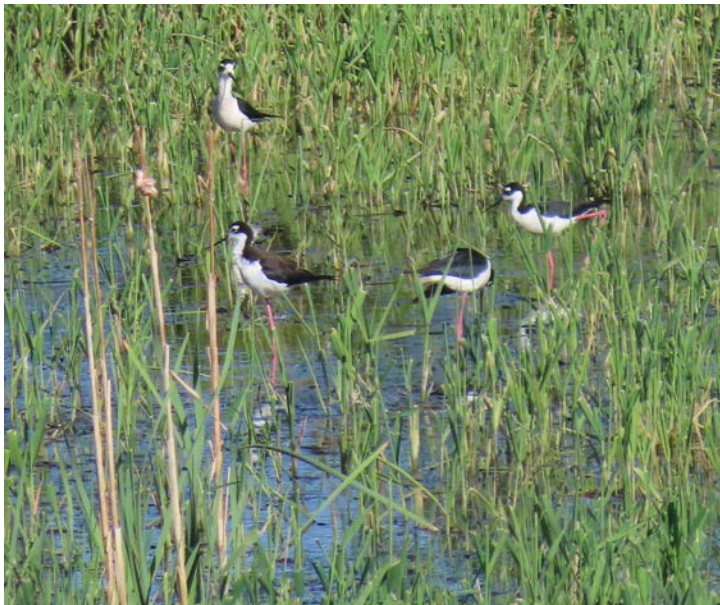
Black-necked Stilts wade at the IAWP.