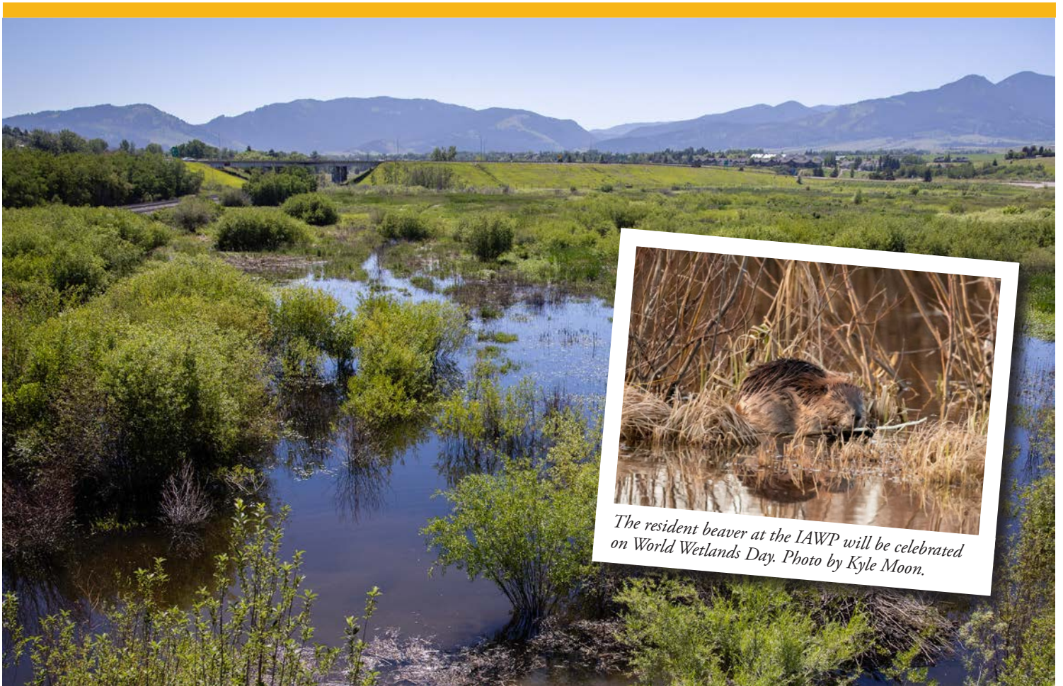
The resident beaver at the IAWP will be celebrated on World Wetlands Day.