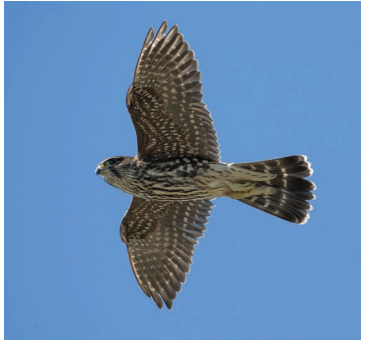
Merlin soaring over the Bridgers.

This is the 31st year of the official count of migrating raptors at this site, and the longest running count of migrating raptors in the western United States. The count will be going on daily, weather and fire season permitting, through October 31st. And—of course—you are always invited to hike up and join the hawk watchers at the observation platform (the helicopter pad at the top of Bridger Ridge). Remember to dress accordingly, bring multiple layers of clothing for unpredictable weather conditions, and plenty of water and snacks for yourself and friends. I'm sure the hawk watchers wouldn't mind a few cookies ;-). You, too, can be part of and contribute to this important raptor study.