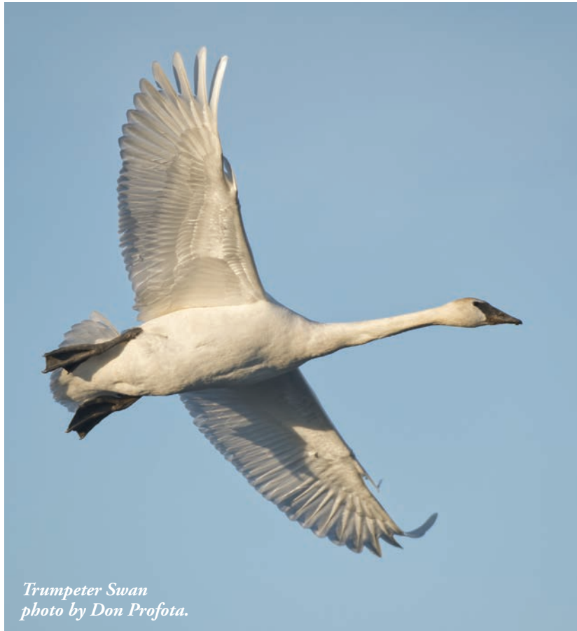
Trumpeter Swan

Find more at the Sacajawea Audubon Society website at sacajaweaaudubon.org