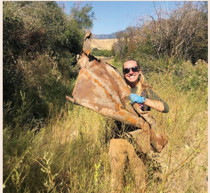
An IAWP Busy Beaver removes a piece of sheet metal from the preserve on Saturday, September 10th.

Busy Beavers and other community members gathered on Saturday, September 10th at 14 different sites within the Lower Gallatin Watershed, including the Indreland Audubon Wetland Preserve (IAWP), to clean up our local wetlands and waterways. During Gallatin Watershed Council's Annual River Cleanup , over 150 volunteers collected 2,138 pounds of trash. Busy Beavers stepped in to be team leaders for various sites. Watershed-wide cleanups such as these will continue twice a year, and Busy Beavers will continue to clean the IAWP on a more frequent basis. The weirdest thing found this year was a vintage Moon Boot covered in moss.