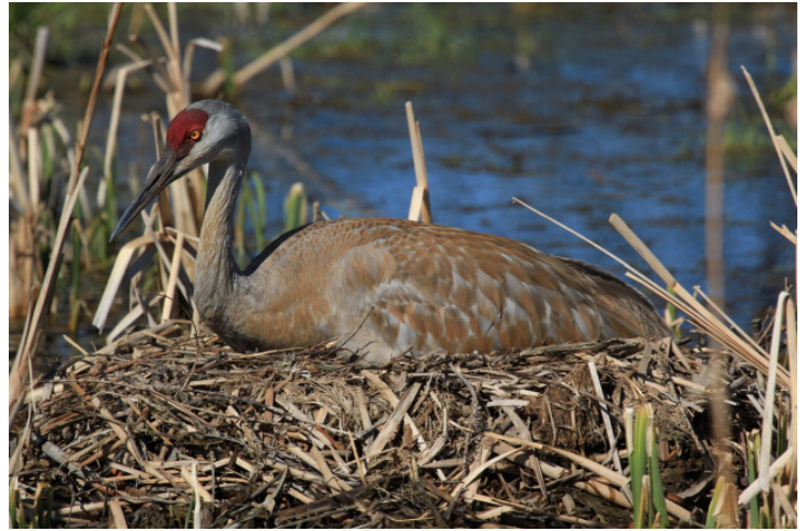
Sandhill Crane

Sacajawea Audubon Society (SAS) is joining with the City of Bozeman to generate and install temporary signs to remind dog owners that dogs are required to be on leash in public park areas unless parks are signed otherwise: as designated off-leash