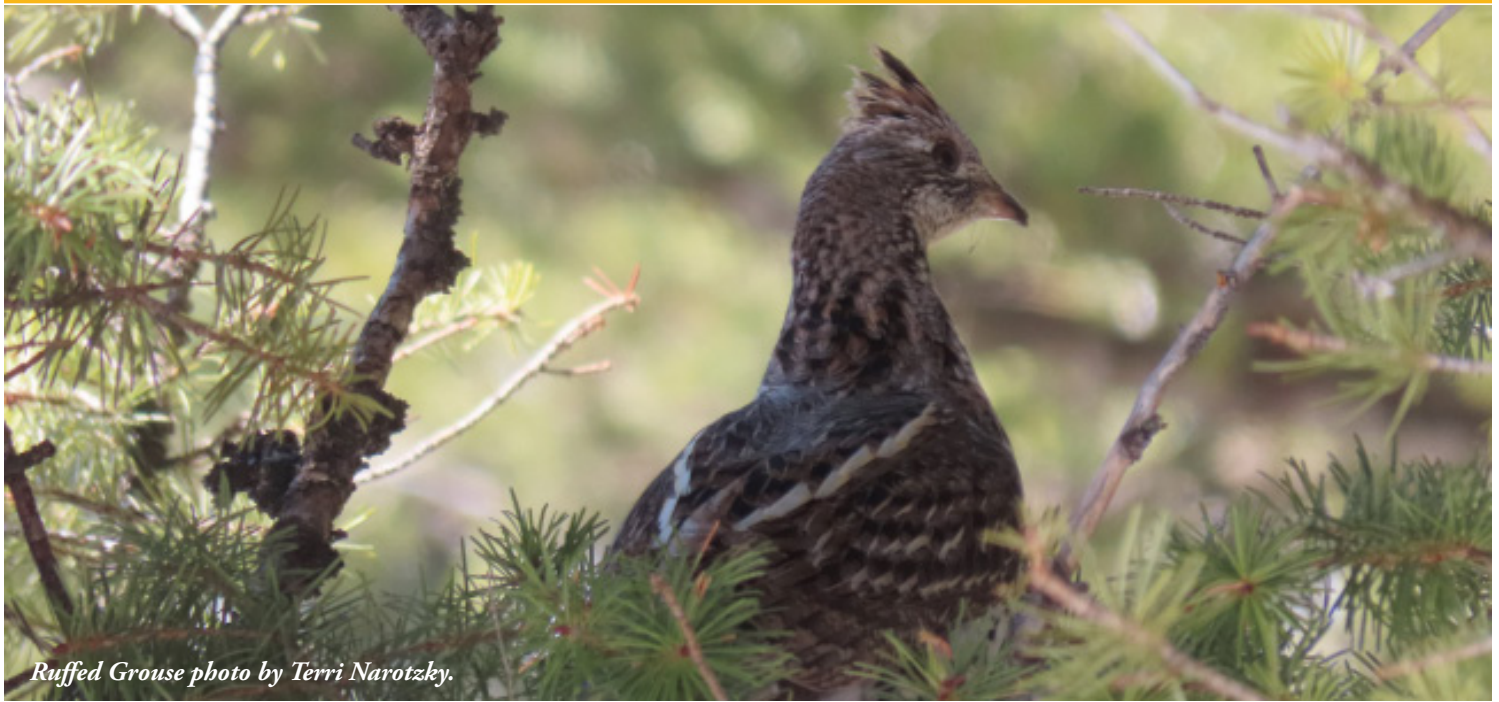
Ruffed Grouse