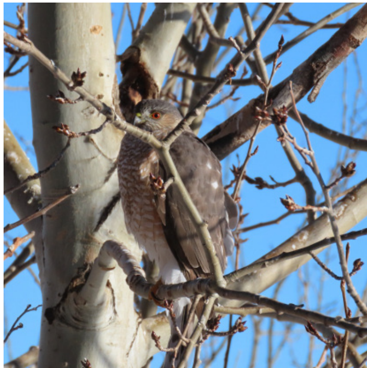
Sharp-shinned Hawk photo by Terri Narotzky.

Section C: Sunday mornings—May 15, June 5, and June 19— from 7 to 10AM at various locations