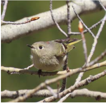
Ruby-crowned Kinglet

There are several habitat types that come together in this relatively compact area, including the riparian areas along Bridger Creek and the conifer slopes of Drinking Horse