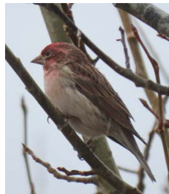
Cassin's Finch

This trail climbs the north slopes of Chestnut Mountain,