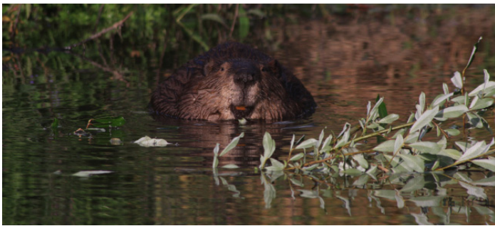
American Beaver

With the new construction project now taking place at Village Crossing, there is a resulting loss of what many people have long used as a place to exercise their dogs. So please be aware that on the IAWP, dogs must be on a leash and only allowed on the upper railroad berm and trestle.