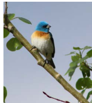
Lazuli Bunting photo by Terri Narotzky.

There are many possibilities at this local birding hotspot. Over 180 bird species have been seen in the recreation area.