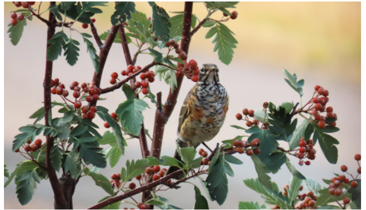
American Robin

You can participate by: joining a team; forming a team; being a "backyard birder"; getting your business involved as a team or