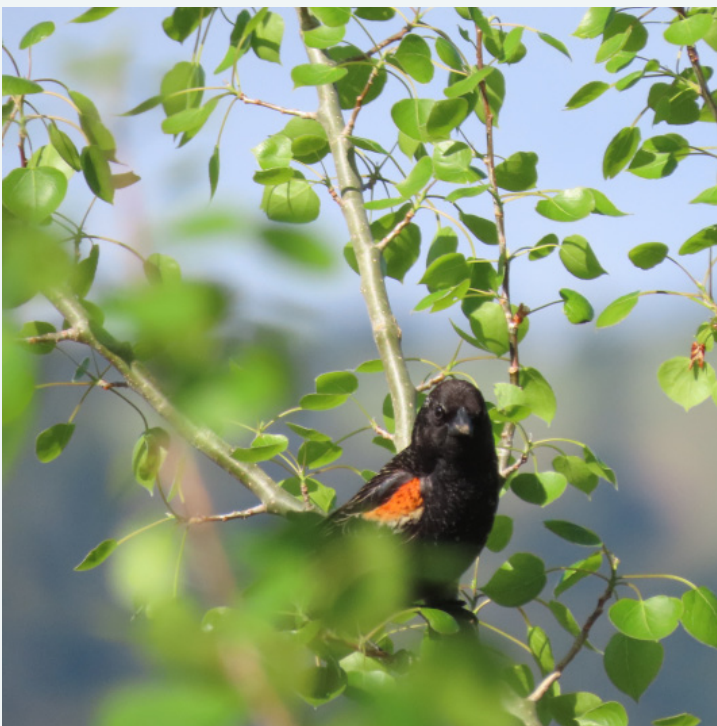
Red-winged Blackbird photo by Terri Narotzky.

Curious about the exciting wetlands preserve that Sacajawea Audubon Society (SAS) is restoring and enhancing? Eager to see some great birds without leaving the city? Join SAS guides for Friday morning Bird Walks .