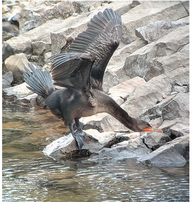
Double-crested Cormorant photo by John Parker.

A lone Double-crested Cormorant that was first spotted at Hyalite Reservoir on October 23rd remained at the lake until the first of December. Like the Lesser Black-backed Gull, this cormorant was well fed, subsisting on a plentiful diet of trout. I saw several small fish literally jump out of the water onto the rocks to evade the cormorant as it swam underwater along the edge of the lake.