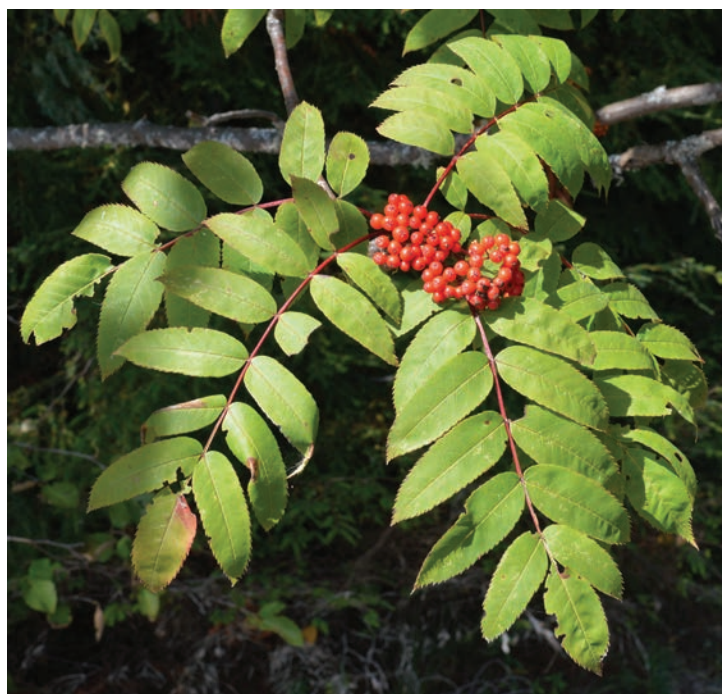
Showy Mountain Ash photo by Ryan Hodnett.