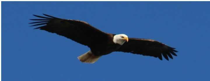
Bald Eagle photo by David R. Tribble.

2020 average of 76 Bald Eagles. This decline is likely related to climate change. Migratory Bald Eagles begin migration when waters begin to freeze in the north, since their main food source is fish. If these water sources take longer to freeze, Bald Eagles may remain in their breeding grounds for longer than typically projected. This results in delayed Bald Eagle migration, occurring in November and December. Bald Eagle movements during late fall would be undetected, due to the absence of site observers, therefore resulting in a smaller Bald Eagle seasonal count.