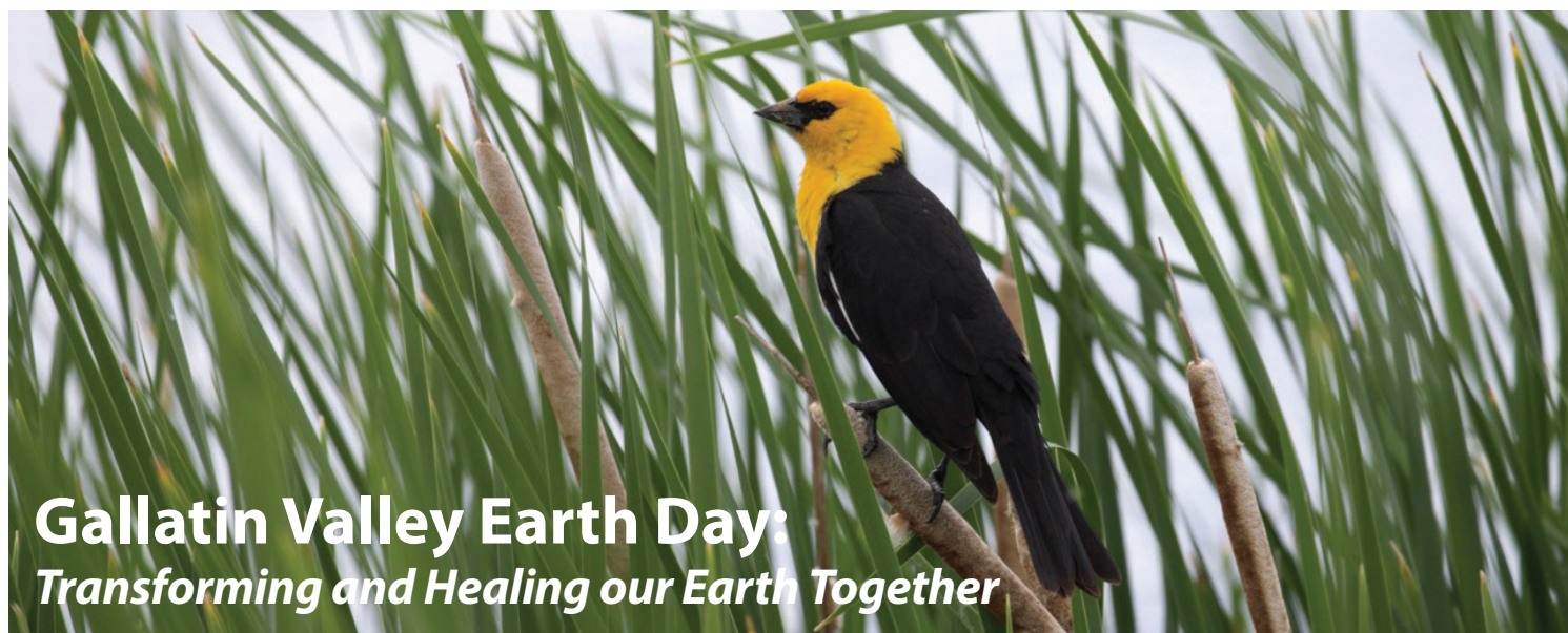
Yellow-headed Blackbird