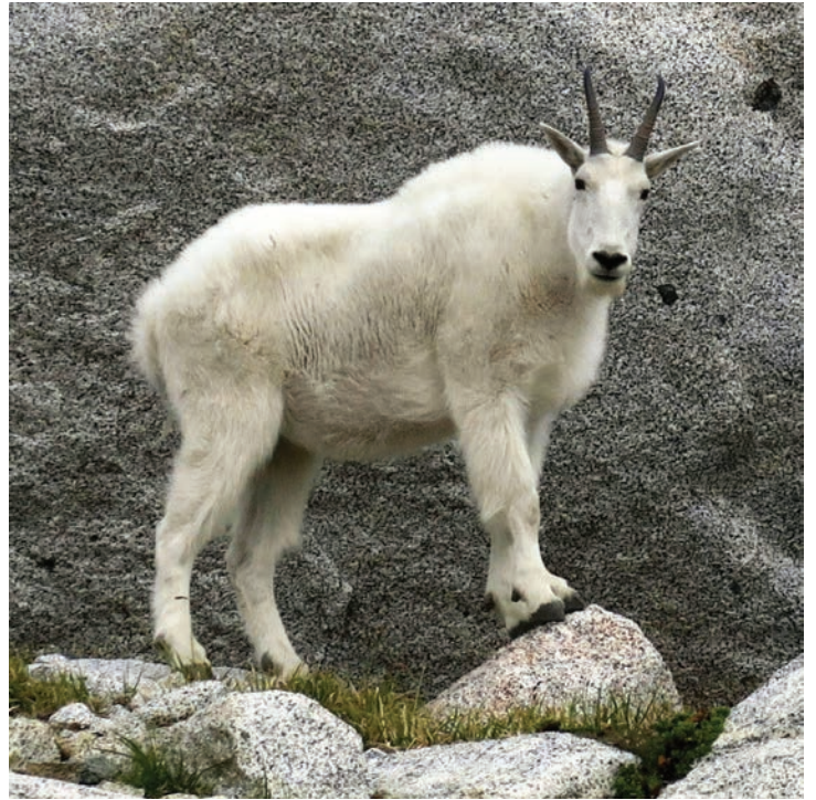
Mountain Goat

Local (non-migrant) raptors, including Turkey Vultures, Red-tailed Hawks, Cooper's Hawks, Sharp-shinned Hawks, Bald Eagles, Golden Eagles, Peregrine Falcons, Prairie Falcons, and American Kestrels were seen at varying times throughout the season. A memorable young, local Golden Eagle was often seen following an adult Golden Eagle and vocalizing. It was also seen flying and playing with Common Ravens.