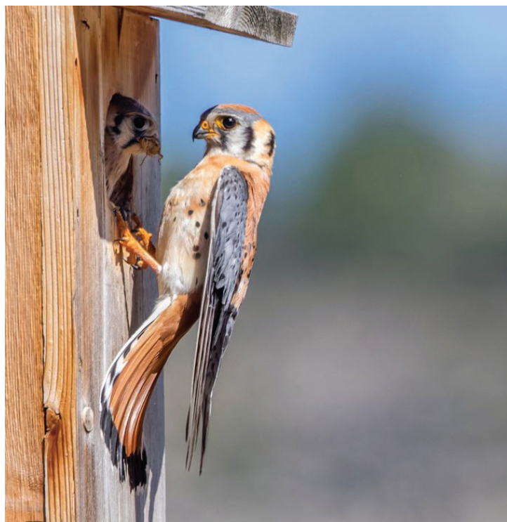
American Kestrel

You can help by sponsoring a Kestrel Nesting Box and learn all about these birds and their nesting habits. Throughout the season—which is NOW—you'll be assigned a box and follow its progress. We will periodically provide information on