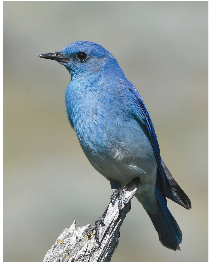
Mountain Bluebird by V.C. Wald.

Some of the other colloquial names for ducks include: "sprig" for Northern Pintail , "spoonbill" for Northern Shoveler ,