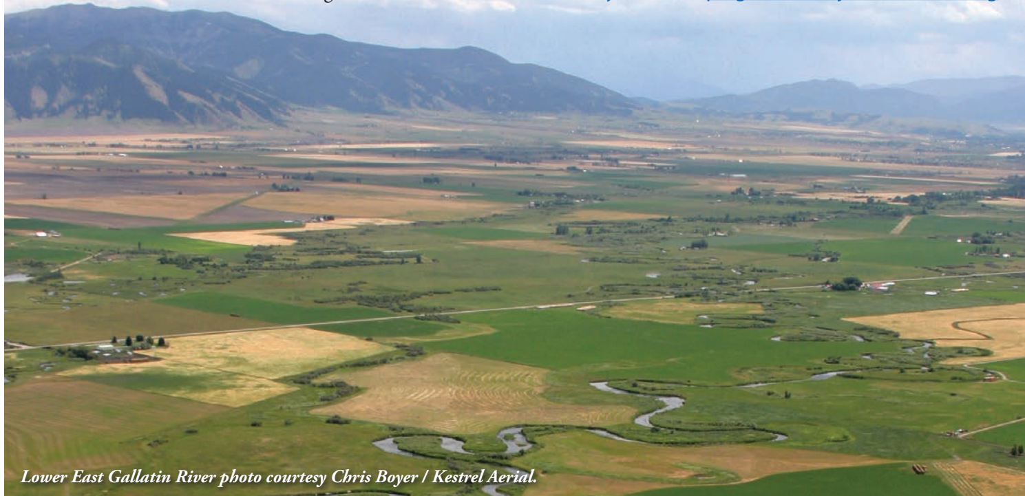
Lower East Gallatin River