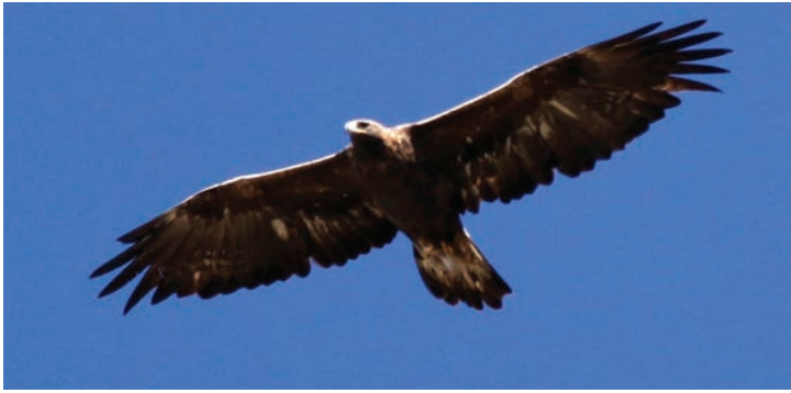
Golden Eagle

2020 average of 76 Bald Eagles. This decline is likely related to climate change. Migratory Bald Eagles begin migration when waters begin to freeze in the north, since their main food source is fish. If these water sources take longer to freeze, Bald Eagles may remain in their breeding grounds for longer than typically projected. This results in delayed Bald Eagle migration, occurring in November and December. Bald Eagle movements during late fall would be undetected, due to the absence of site observers, therefore resulting in a smaller Bald Eagle seasonal count.