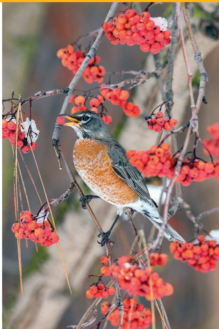
American Robin in Showy Mountain Ash.