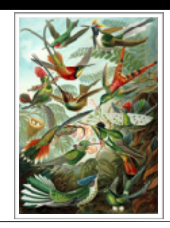
A color plate illustration from Ernst Haeckel's Kunstformen der Natur (1899), showing a variety of hummingbirds