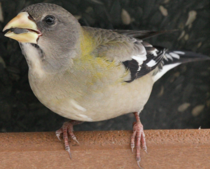
Evening Grosbeak