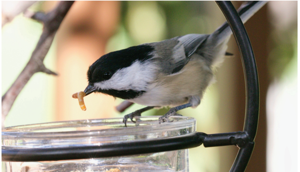
Black-capped Chickadee