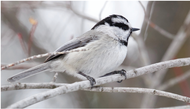
Mountain Chickadee