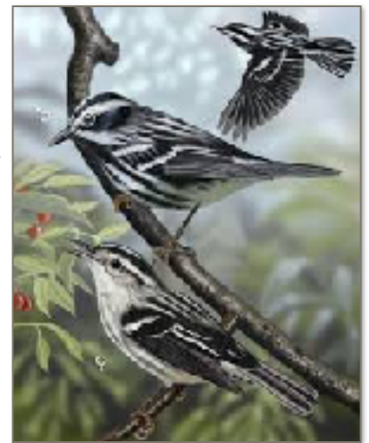
Black & White Warbler

On the morning of September 14 th as the first cold storm of the autumn arrived, Oliver James was rewarded with a couple of rarities taking shelter in the woods on the east side of EGRA. The Bay-breasted Warbler that Oliver saw was only the third time this eastern warbler has been seen locally. There have been approximately 30 sightings of Bay-breasted Warbler in Montana, with half of these sightings coming from the far northeastern corner of the state. Not as rare as the Bay-breasted Warbler, but still a great find this far west in Montana, was the Black and White Warbler Oliver found that morning. Later that afternoon Andrew Guttenberg, Tom Forwood, Matt Keefer, and Oliver all got to share looks at two Blackpoll Warblers . While not as rare as either the Bay-breasted or Black and White Warblers, Blackpoll Warblers are still a nice find this far west.