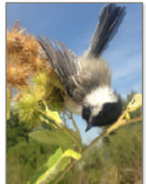
Another Sad Casualty