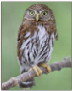
Northern Pygmy Owl